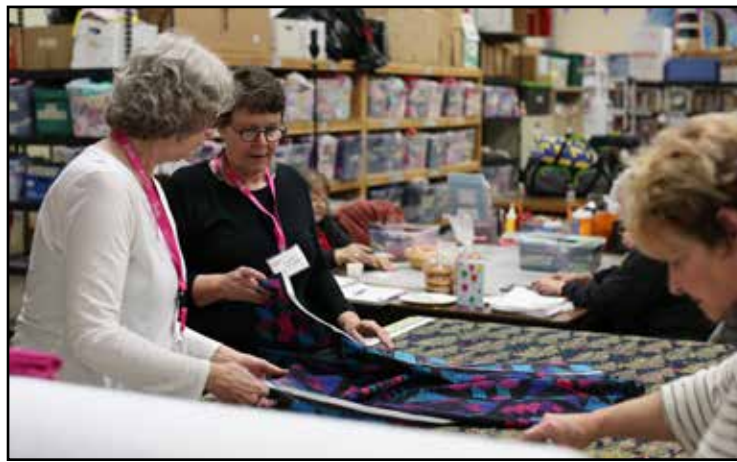
Volunteers get ready to sew bags, such as those below.

For the past 11 years, Bags of Love has provided support to children suffering from the damaging effects of abuse, neglect, poverty, and homelessness. Last year, more than 2,200 Lane County children and teens received a “bag of love” filled with clothing, outerwear, toiletries, school supplies, toys, and the handmade quilt or fleece blanket that is the signature of every bag we distribute. Our bags fulfill physical needs and provide basic necessities, but they also do much more than that — they offer comfort, security, and hope to children when they are at their most vulnerable. We work with 54 regional nonprofits, school districts, and government offices, such as CAHOOTS, Centro Latino Americano, Head Start of Lane County, and the Department of Human Services, to distribute bags to the children they serve, at no