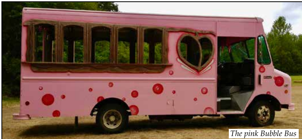
The pink Bubble Bus